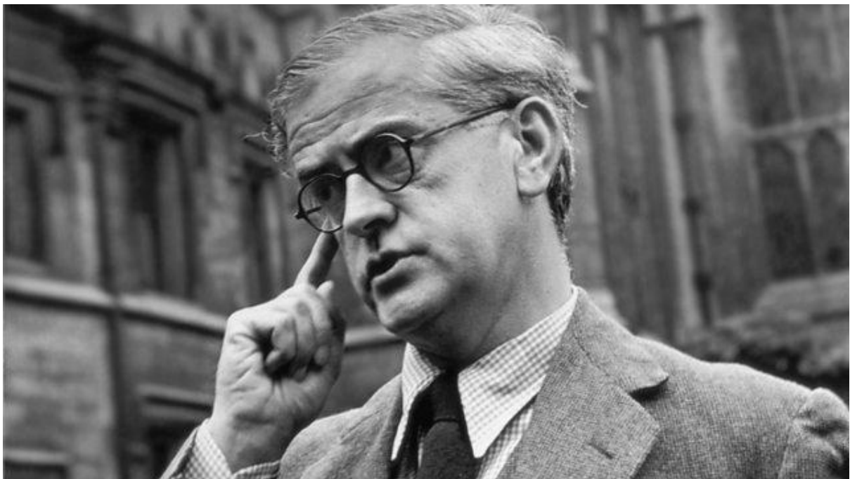
A. L. Rowse (1903-1997)

We have had Daphne du Maurier's Vanishing Cornwall , Winston Graham's Poldark's Cornwall and eventually Betjeman's Cornwall [published in 1967, 1983 and 1984 respectively] – none of them Cornish, all of them having adopted Cornwall ... When is someone going to see that a 'Rowse's Cornwall' 7 would be a different matter – history, antiquities, villages, crevices, holes and corners, relics, what is beneath: the real Cornwall. 8