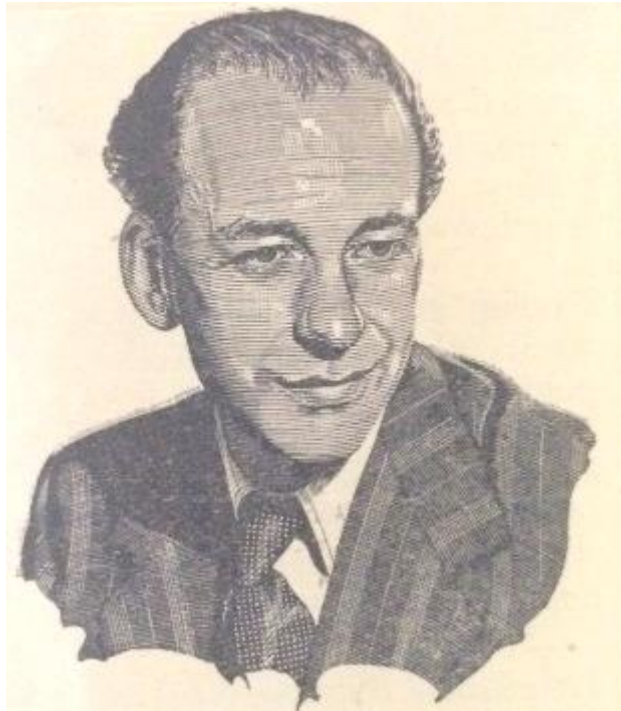
Winston Graham, winner of the Crime Writers' Association Trophy for 1955. (See Crime Trophy.)

6 Clipping on page five from Smiths Trade News and below from Publishers Circular , both 14 April 1956