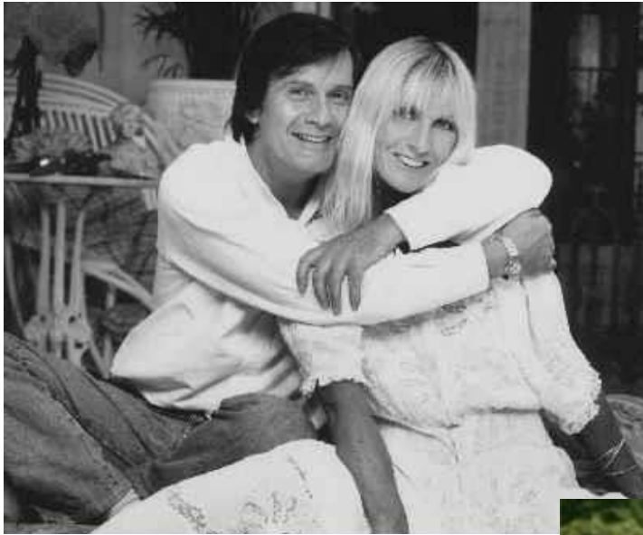
(i) Ralph Bates and his wife Virginia Wetherell