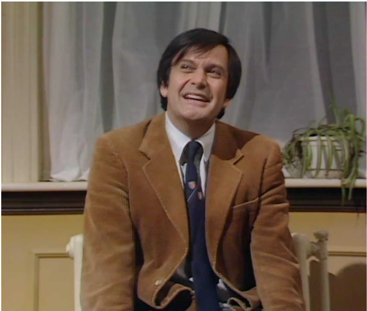
Dear John (BBC, 1986-7)