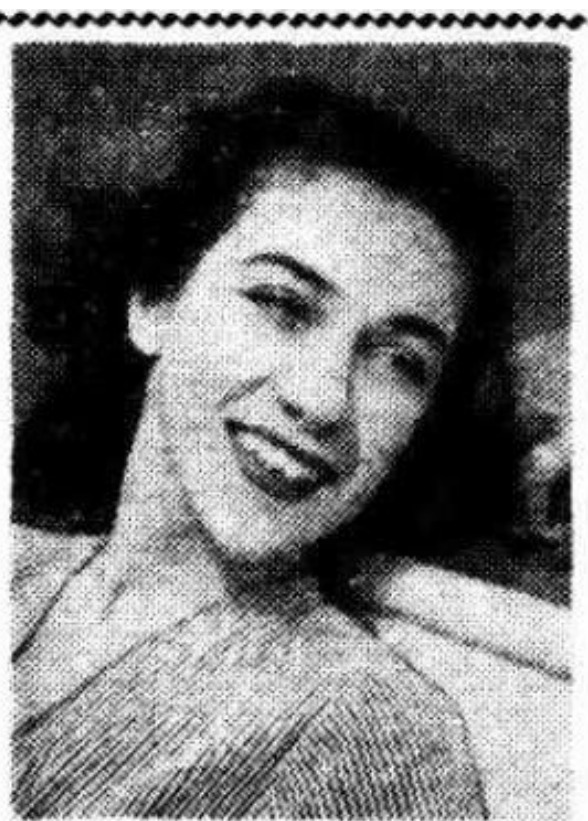
DINAH SHEARING stars in the General Motors Hour drama, Night Without Stars , from AW at 8 tonight (Thursday, Nov. 18).

(2GB serving Sydney, 4BH Brisbane, 7LA Launceston and AW Melbourne)