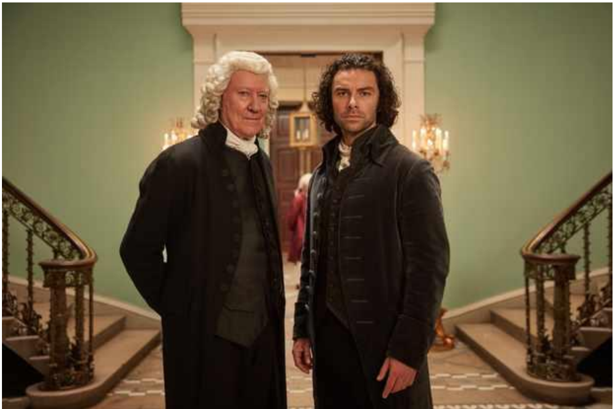
Meet the new Ross ... Robin Ellis and Aidan Turner, Poldark , 2017